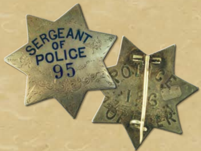
Above front and back: Interesting sterling silver Sergeant of Police #95 badge in hard fired blue enamel. This badge was originally a police officer rank on the reverse. Unknown city of origin, circa 1880. Value B

Collectors, historians and the public from all over the world have been fascinated with images of early lawmen, identified not by uniform, but by the badge pinned to their chest and will find in this volume a fascinating photographic history, as well as a price and reference guide.